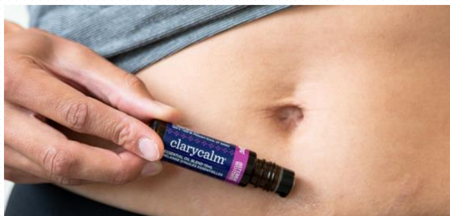
Monthly Blend for Women